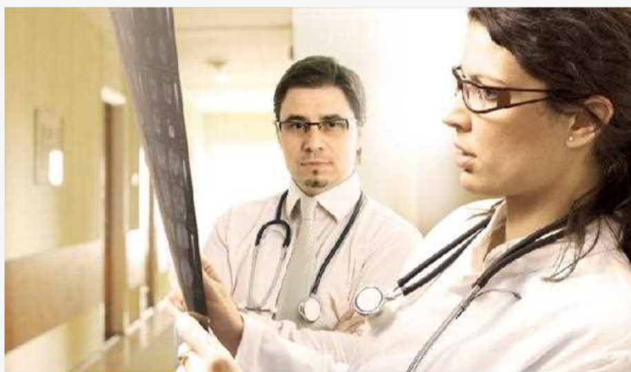
Hemorrhoids Hemorrhoid Hemorrhoid Relief Bowel Hemroids