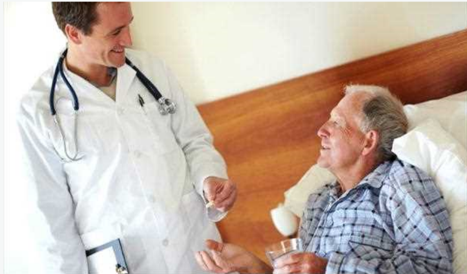
PilesBowelExternal PilesPiles ReliefPiles TreatmentInternal

Mango Seeds: The process of using mango seeds as a piles treatment is a little longer as they will need to be dried out thoroughly and then crushed into a powder. Mango seed powder can be taken as and when piles flare up but only twice a day and a single dose should be no more than two grams, many people find an easier and more pleasant way to take this particular powder is to mix it with honey.