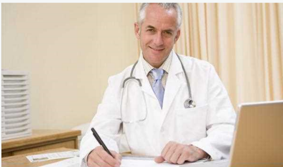
HemorrhoidsHemorrhoidExternal HemorrhoidsInternal HemorrhoidsExternal

“ While internal hemorrhoids take place above the particular dentate series, outside hemorrhoids take place below the line. Best bet: Having the lingo might help you translate op notes, however having your personal doctor indicate "internal" or "external" will reduce virtually any potential coding mistakes. Search for 'internal' excision training Lack of specific internal hemorrhoid excision requirements can be perplexing. Solution: With the addition of the following text note, CPT 2010 gives you the permission to use use of certain codes for internal and/or external hemorrhoids: "For excision of internal and external hemorrhoids, see 46250-46262, 46320.